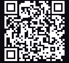
RUTM52 360° VIEW